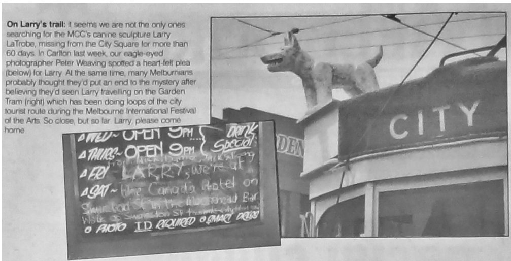
Figure 4: 'On Larry's Trail,' Melbourne Times, 1 November 1995.