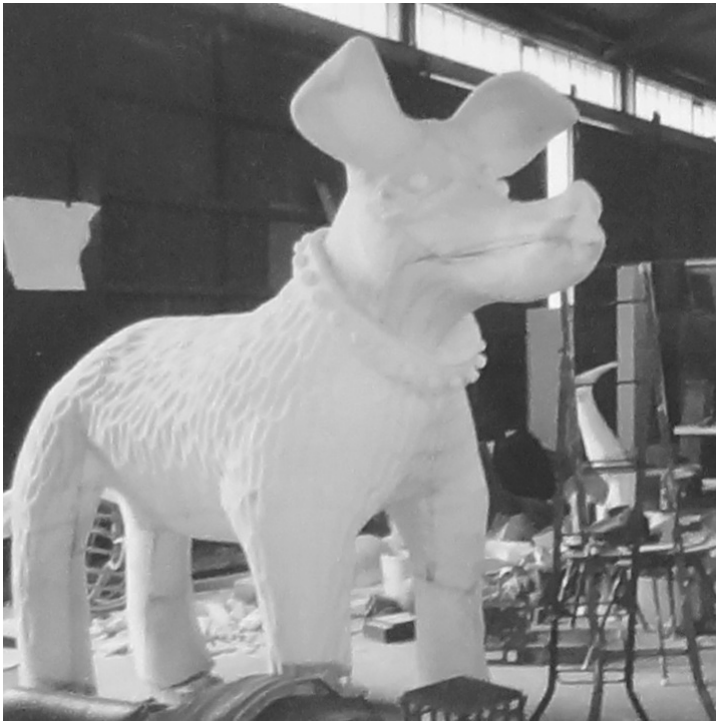
Figure 5: Larry La Trobe Moomba Float, ca. early 1996.

eration of Melburnians that had watched Lassie Come Home in 1943, an American film based on the novel of the same name, set in Yorkshire during World War II. Many newspapers ran stories on Larry's theft. The Melbourne Times was on the lookout for 'loveable Larry', (fig. 4); the Caulfield Leader wrote 'all is forgiven'. 66 Larry was even included in the Age's 'Best of Melbourne' of 1995 under the heading 'Best Sculpture'; described as 'Larry the bronze bitser dog statue', Larry was preceded by 'Best Theatre' (Princess) and followed by 'Best Established Artist' (Arthur Boyd). 67 By placing Larry in this new context, he was conjoined with two significant local features: a grand theatrical institution and an eminent visual artist. This unsettled previous accounts of Larry, fixing him to Melbourne like the architecture of the Princess Theatre and suggesting an association with high art. Unpremeditatedly, inadvertently, spontaneously, an absent Larry propelled himself to fame, in the process appropriating an authentic perch amidst civic lore.