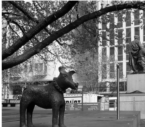
Figure 3: Larry La Trobe with Burke and Wills and City Square, 2012 (author's collection).