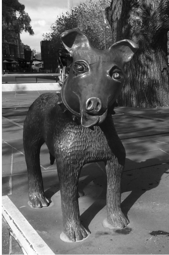
Figure 1: Larry La Trobe, 2012.