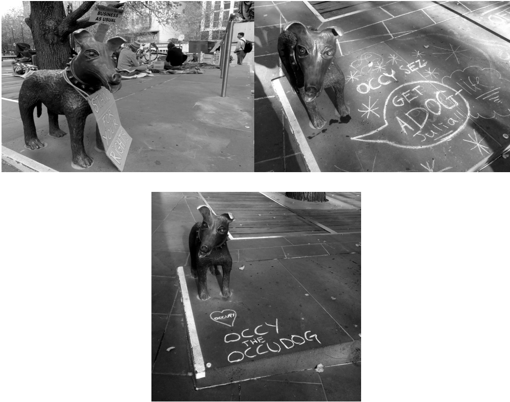
Figure 7: Larry La Trobe 'occupied' by Occupy Melbourne movement, May 2012.

grid's edge, is more prominent). He maintains his charm after two decades, eliciting smiles on many of the faces of passers-by, children and adults alike.